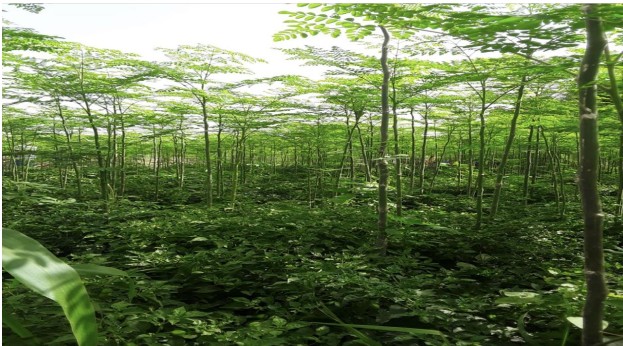
Moringa field in the village of Margou, in Dosso: This is an example of an economic incentive for local community greening efforts.

Baobab ( Adansonia digitata ): The rural populations participate in its regeneration by planting in the fields, in villages, and even in the form of small baobab parks (food banks). The baobab provides two main food products, leaves, and fruits, used for consumption and trade. Prices vary from 750 to 1000 FCFA per bag of 100 Kg during the production period and from 6,000 to 7,000 FCFA in the dry season (FAO 2005). As for the fruits, they are consumed as is or transformed into juice.