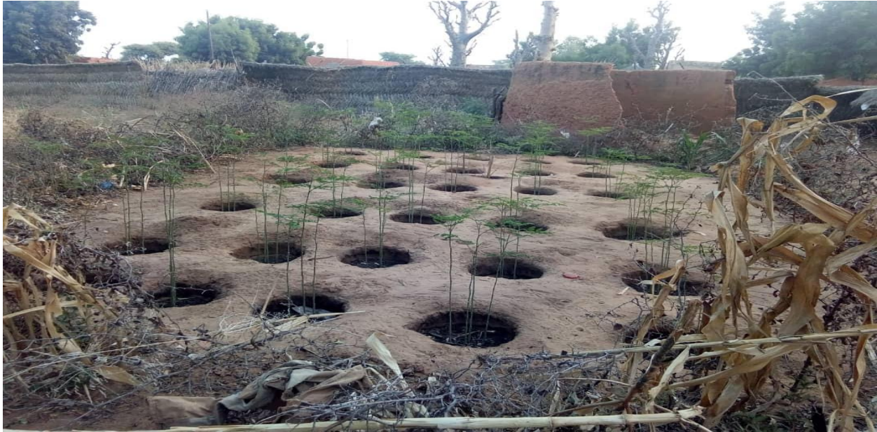
An indigenous moringa nursery in the village of Margou, Dosso.